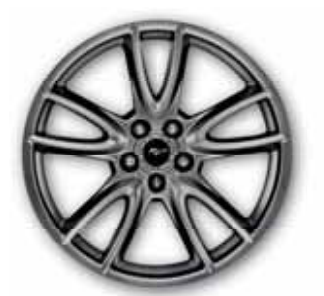
19-in. Dark Stainless Painted-Aluminum Wheels included with Brembo Brake Package