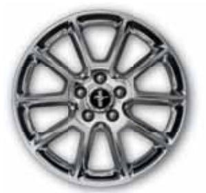
18-in. Sterling Gray Metallic Painted-Aluminum Wheels included with Mustang Club of America Edition