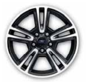
17-in. Machined-Aluminum Wheels with Painted Pockets Standard