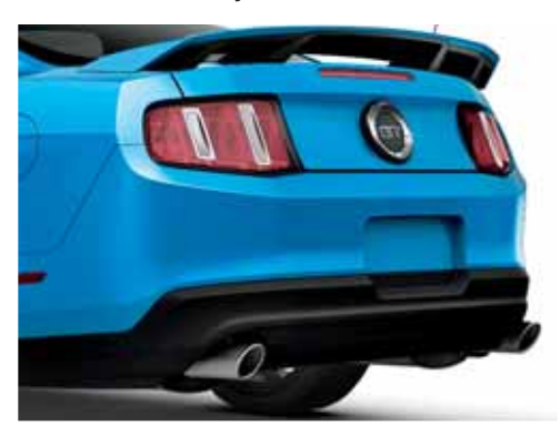
Rear Lower Fascia – Diffuser-Style