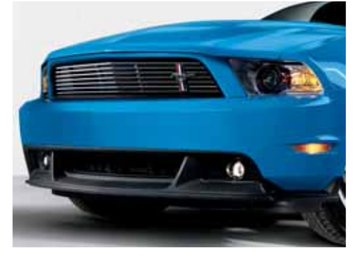
Chrome Billet-Style Grille and Front Lower Fascia