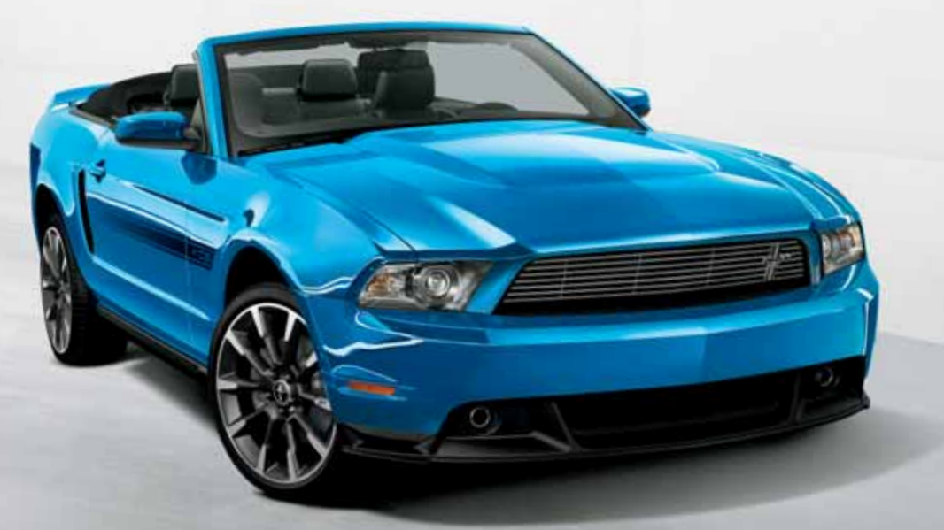
GT Premium/Convertible/Grabber Blue/California Special Edition

GT Premium/Charcoal Black Leather/ Cashmere-Colored Racing Stripe/Premier Trim With Color Accent Package