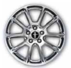
18-in. Polished-Aluminum Wheels included with V6 Pony Package