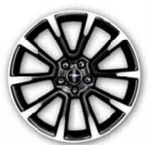
19-in. Painted Machined-Aluminum Wheels included with V6 Performance Package