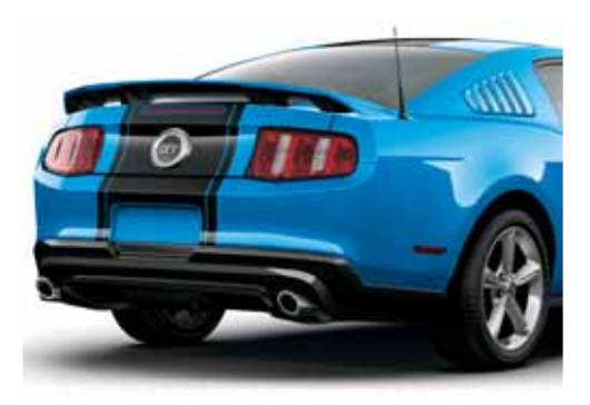
Pedestal Rear Spoiler and Quarter Window Louvers