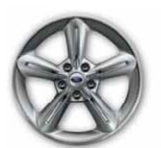
18-in. Wide-Spoke Painted-Aluminum Wheels Standard